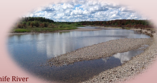
Redknife River Proposed Conservation Zone