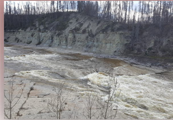
Upper Trout River—Proposed Conservation Zone

Proposed Area Open for Development 110,000 square km (50% of Dehcho Region) Equal to 1/5 of the Yukon