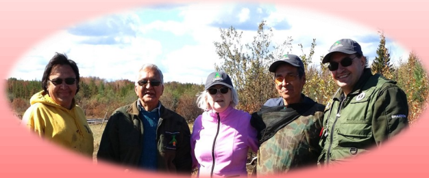
Left to Right