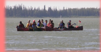
2014 Dehcho Youth Ecology Camp