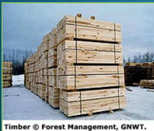
Timber