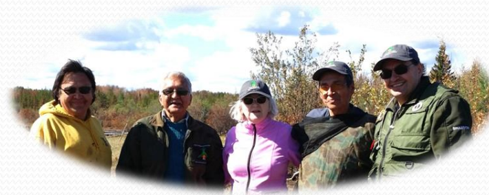
2016-17 DLUPC Committee Members