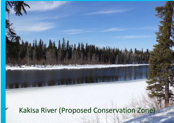
Kakisa River (Proposed Conservation Zone)