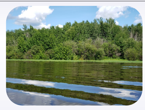
Horn River — Proposed Conservation Zone