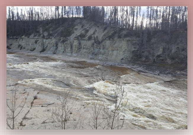
Upper Trout River—Proposed Conservation Zone