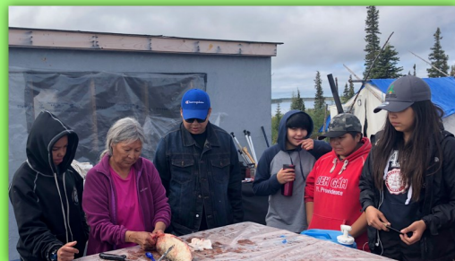
Dehcho Youth Ecology Camp 2018 - Edehzhie