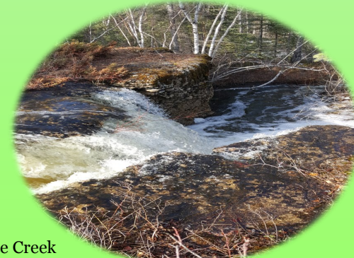
Wallace Creek Proposed Conservation Zone